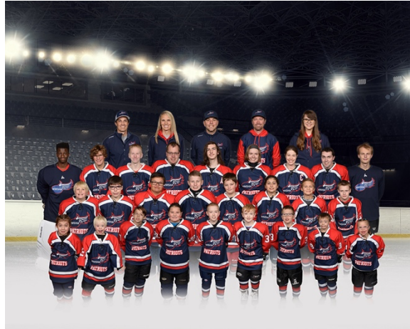
WEST MICHIGAN PATRIOTS

Children with disabilities, unfortunately, do not have the same opportunities as their peers to play on a team. The West Michigan Special Hockey Association (WMSHA) was established in 2014 with a mission to offer an amateur level ice hockey program for children and adults with any developmental disorder. The WMSHA is made possible through generous gifts from individuals, businesses, corporations, foundations, and the dedication of volunteer staff. Please consider contributing a tax-deductible gift to sponsor the 2024 WMSHA Team. Donations underwrite the cost of ice time, uniforms, and equipment. Your donation allows all to participate free of charge.